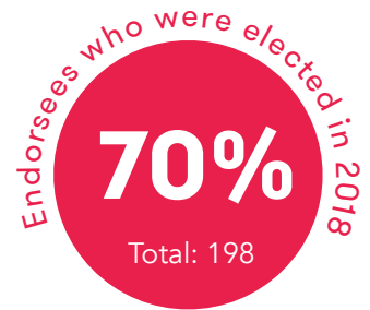
Key states (FL, OH, MI, VA)